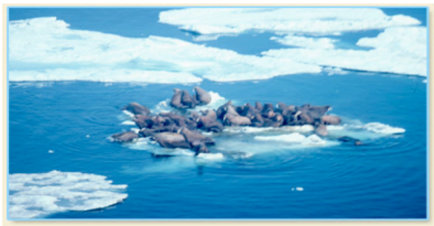
Figure 3. Elementary School Student Research Paper Image 2.

I concluded that the walrus population is being affected by the melting sea ice. I had guessed this in the beginning of my research. My evidence supports this conclusion because as walrus are being abandoned they are dying so that means there is less walrus to reproduce. Also, as the ice line is retreating it is becoming harder to hunt along with the walrus food. This means the indigenous people are running out of food and the other things they can make from their bones and skin. The walrus are also starving because their food sources are disappearing like I said above. What we have to think of now is going to happen? If you think about it about it is like a vicious circle that affects almost everything. If the polynas are melting than the clams and mussels are dying. If the mussels are dying then ther walrus are starving. If the walrus are dying then the indigouenas people aren't finding food. If the people aren't finding food then they are dying. It really is sad. It makes me think "how can I help?"