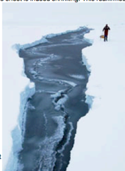
Figure 7. High School Student Research Paper Image 2.

Now knowing that the Greenland ice sheet is shrinking, many questions have arisen. The most prominent question is whether or not the Antarctic ice sheet is shrinking, for its impact would be tenfold of what the Greenland ice sheet has done.