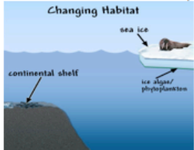
Figure 2. Elementary School Student Research Paper Image 1. Image credits U.S. Satellite Laboratory, Inc.

Since the walrus are disappearing people have to find a new source of food.